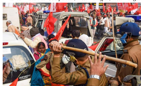
Police brutality on the joint demonstration in Patna on 29 December 2020