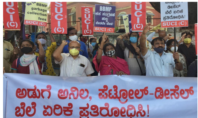
Protest by SUCI(C) in Bangalore on 21 December 2020 against massive hike in the prices of LPG-Petrol-Diesel,

[Source: First Post-22-11-13, Business Today 26-03-14, 08-10-19, 27-03-20, The Wire 26-11-17, 27-11-17, daily O 29-01-19, knnIndia 20-02-19, Economic Times 19-11-19, New Indian Express 28-02-20, Times of India 12-05-20, Timesnews network 02-06-20, The Mint 01-06-20, Business Standard 20-10-20, Outlook 01-11-20, Ahmedabad mirror indiatimes-08-12-20]