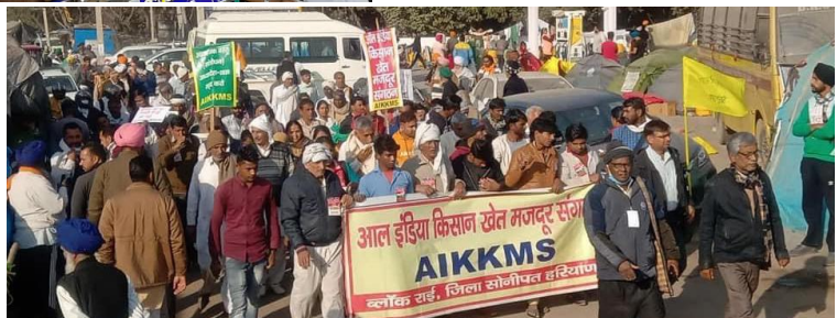
Tractor rally of AIKKMS from Sonipat to Singhu