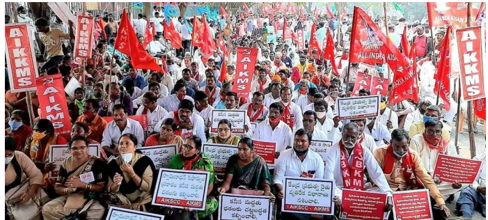
AIKKMS activists in the joint demonstration in Hyderabad on 30 December 2020