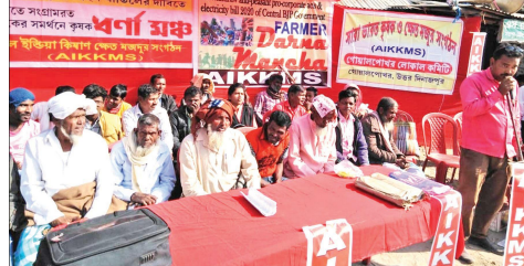
Dharna Manch at Goalpukhur, West Dinajpur, West Bengal