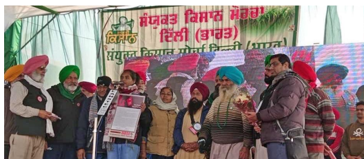
AIDSO leaders and activists at Singhu border

that indomitable spirit is observed in this epoch-making peasants' movement. If the rudder passes on to the hands of correct revolutionary leadership, the sail would gain winds and chill would be sent down the spine of the exploitative despotic arrogant rulers. This is but the struggle of the poor and oppressed, in self-defence, against the rich. There is no region, no caste, no