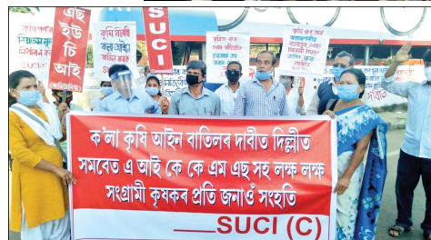
Protest demonstration by SUCI (C) at Nalbari, Assam