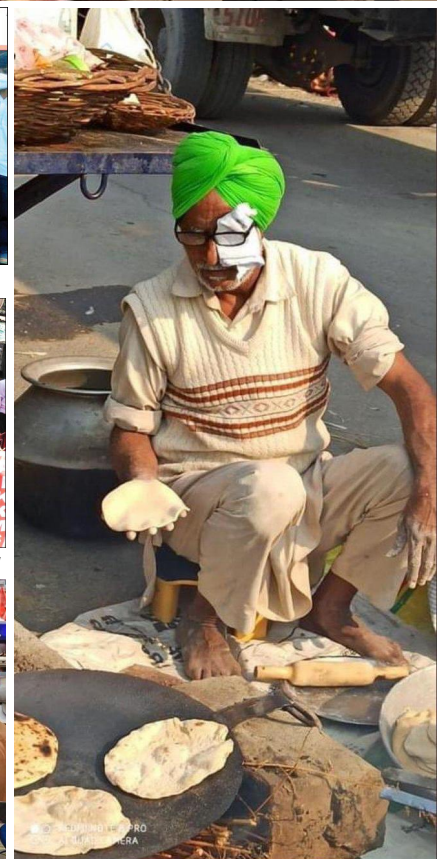
A peasant who has undergone an eye operation recently preparing roti at the demonstration site