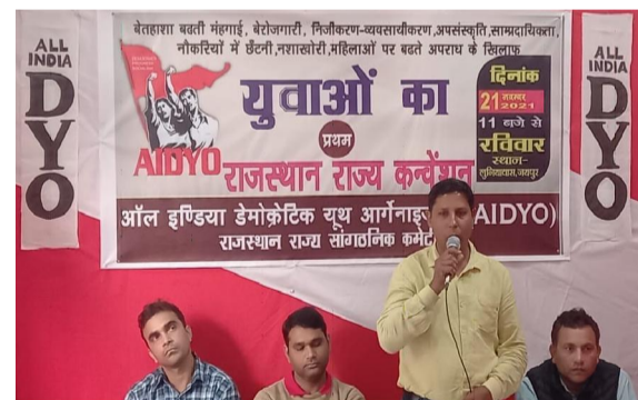
Rajasthan on 21-11-21