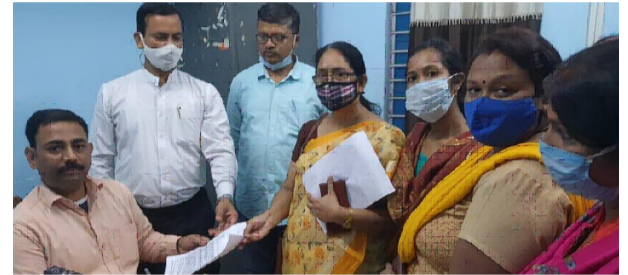
Deputation to MD, Adityapur Electricity Department, Jharkhand, on 23 November

Electricity Consumers' Association, an all India platform to organize people's movement against Electricity Act 2003 and proposed Electricity (Amendment) Bill