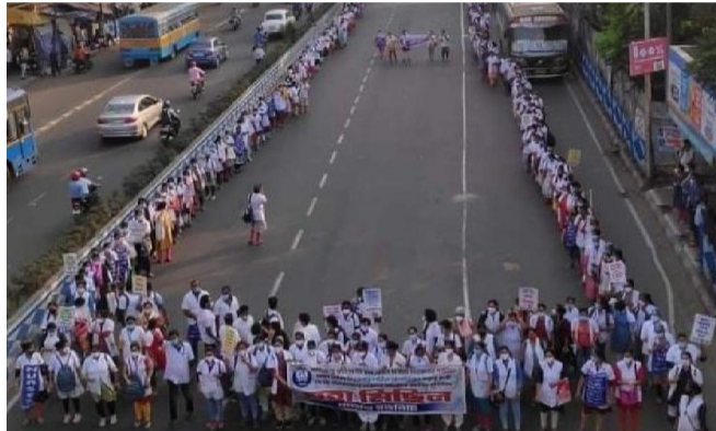
Rally on 27 November

After failing to persuade the state government for three odd years to accede to their legitimate