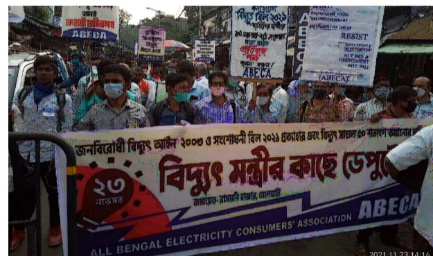
observed a protest fortnight from 10 to 25 November throughout the country