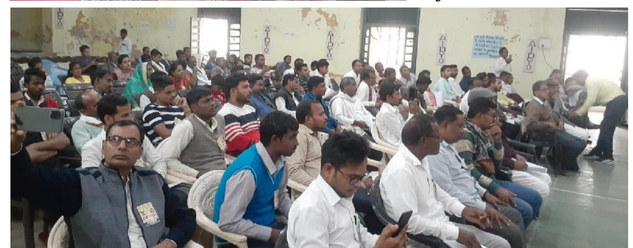
Uttar Pradesh on 14-11-21