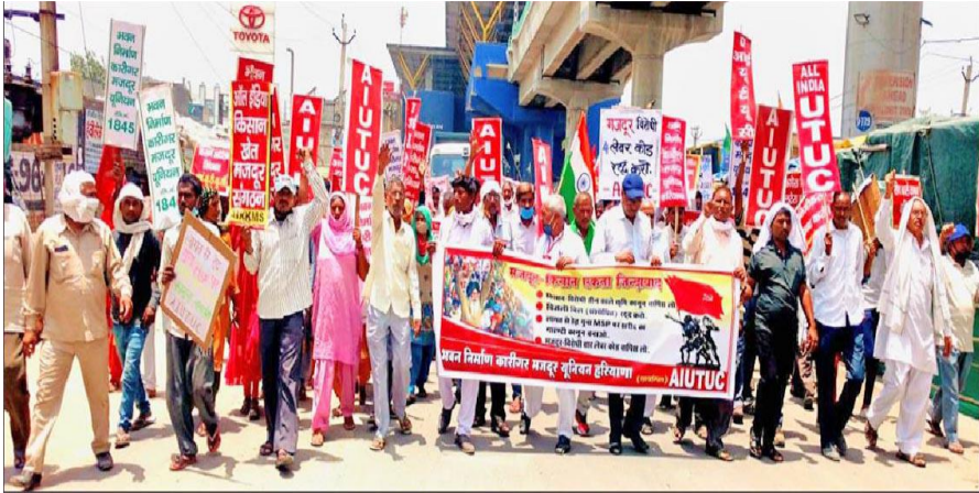
Construction Workers' Union affiliated to AIUTUC organized a March from Bhiwani, Haryana to Singhu border, Delhi, on 6 July in support of the ongoing historic peasants' movement.