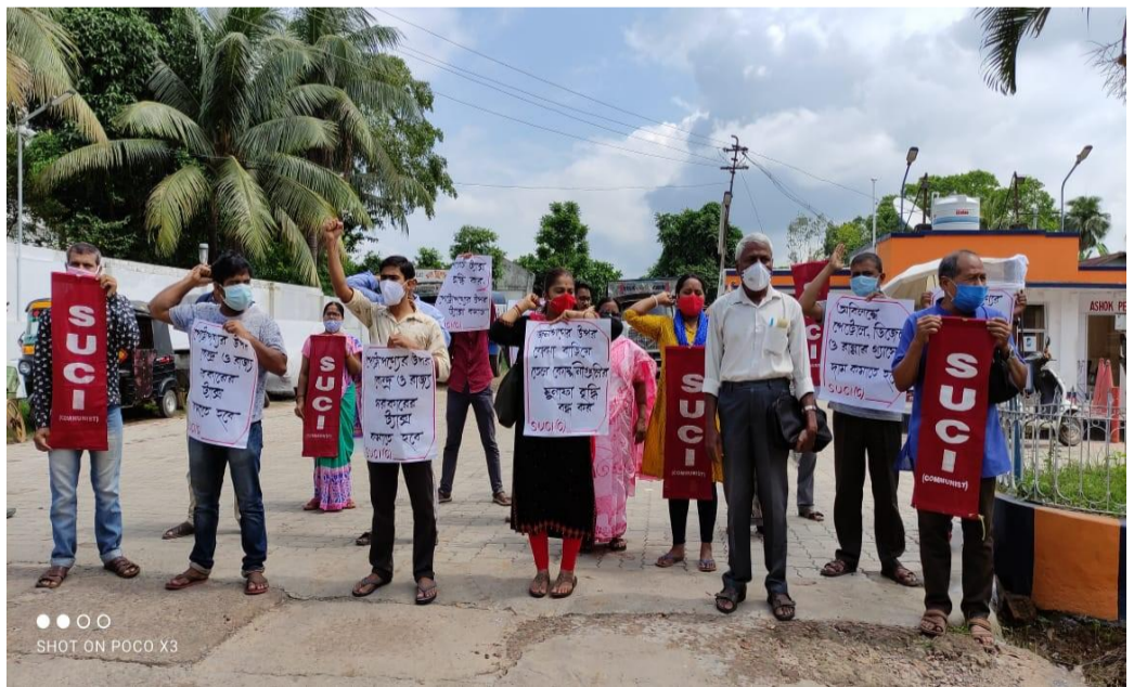
Demonstration in Agartala, Tripura against exorbitant rise in petrol-diesel-LPG and Kerosene prices Agartala on 5 July near Indian Oil Company office.