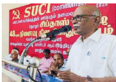
Theni, Tamil Nadu