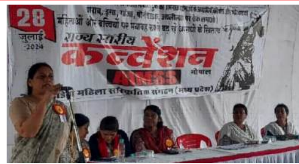
AIMSS Convention in Bhopal, MP, on 28-07-24 on growing crime against women, reckless spread of obscenity etc

I appeal to the people of West Bengal as well as entire India not to be carried by such baseless motivated propaganda cunningly spread by the quarters of vested interest. I reiterate that in the movement of Bangladesh, not only Muslim but Hindu students, both male and female, have sacrificed their lives. Blood of both the