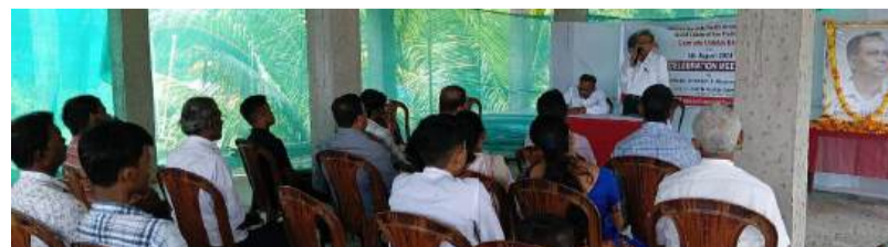
Port Blair, Andamans