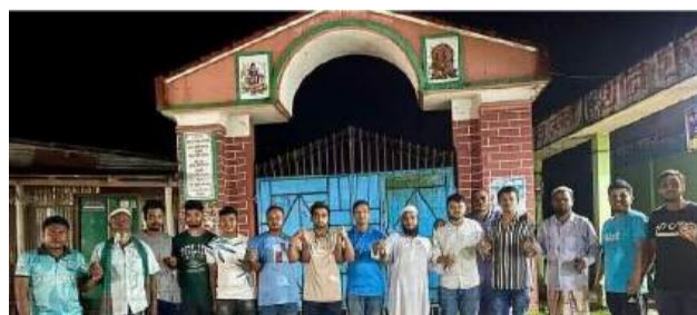
Muslim brothers guarding Hindu temple in Bangladesh

out a statement of the protesting students. According to them, after beating retreat, Awami League and Chhatra League are hatching a conspiracy to malign the movement. My supposition is that the police had only opened fire but the military was not involved in it. The lower rank of the military had mounted immense pressure on their leadership for not opening fire on the protesters. But the