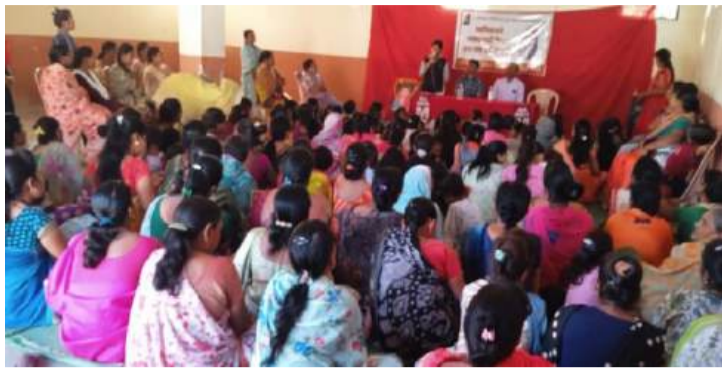
Observance of birth anniversary of Savitribai Phule by AIMSS in Maharashtra, Nagpur