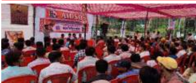
Students' rally and meeting on education-related problems organized by AIDSO. Chhattisgarh on 31 March last at Raipur