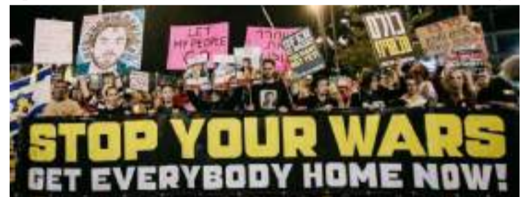
Protest Demonstration in Tel Aviv, Israel

education is constantly declining, but the gravest evil is the all-pervasive moral and ideological crisis now gripping the people, the youth in particular. Fostering this all-pervasive degradation in the social life and using it as a handle, the ruling class, the exploiting bourgeoisie wants to break the moral backbone of the entire nation. Because, if people have high moral and ideological standard only then can they stand erect like men worth the name, with head held high even in the midst of unbearable miseries. And if that high standard is absent then men, though