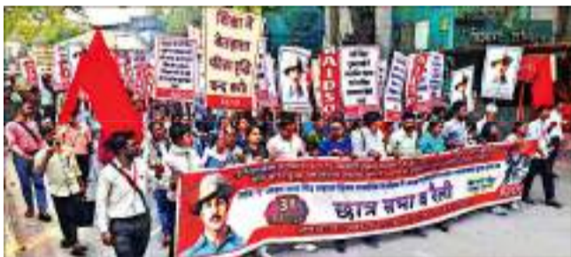
Bhagat Singh-Sukdev-Rajguru Day observed on 23 March 2025 by AIDSO and AIDYO in various places of UP (photo of Jaunpur programme)

We, on behalf of the people of India, fully support the struggle of the people of Nepal to thwart this conspiracy to restore monarchy in Nepal and protect democracy and the democratic system. We also call upon the democracy-loving people of the world to stand by the struggle of the people of Nepal.