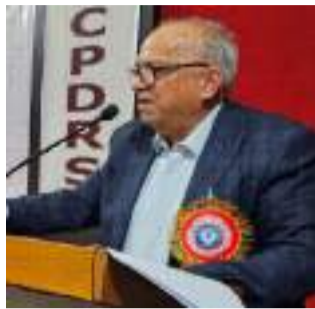
Justice Patnaik addressing

The "Centre for Protection of Democratic Rights and Secularism" (CPDRS) held its All India Convention on 30 March 2025 at Ghalib Institute Hall, New Delhi. This convention was organized during the most challenging time