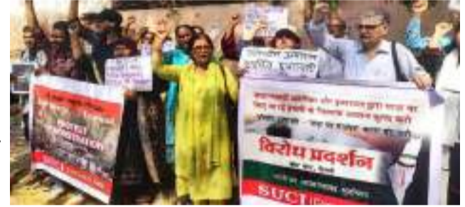
Protest Demonstration against US imperialism in Delhi by SUCI (Communist)

Trump's second sword has befallen the National Institute of Health (NIH) and the Department of Health and Human Services (HHS).