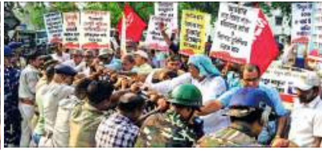
■ Barrackpur, North 24 Parganas