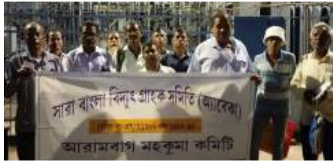
■ West Bengal