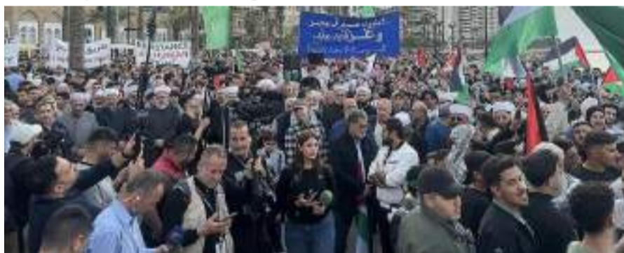
Protest Demonstration in New York, USA

outrage was dulled by fatigue and misinformation.