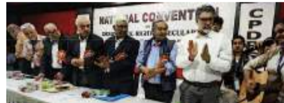
Hon'ble judges and other dignitaries on the dais adding voice and clapping with the rhythm of 'We Shall Overcome'