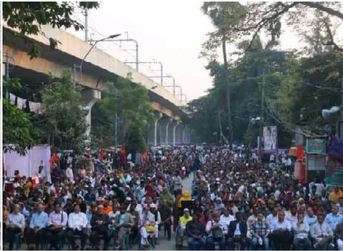
To commemorate 108 th anniversary of Great November Revolution and 45 th foundation anniversary of BASAD (Marxist), a massive rally followed by a mass meeting was organized in Dhaka on 21 November.