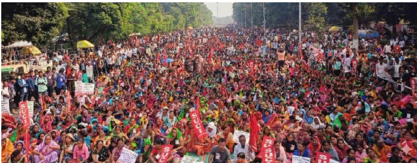
Massive demonstration by SUCI(C), Odisha State Committee, before state secretariate, Bhubaneswar, on 25 November against the anti-people policies of central and state governments