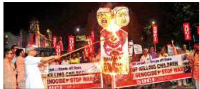
Effigies of Trump – Netianhu burnt in Kolkata. 22 March

Till the time, socialism comes back with renewed vigour—an inevitably ordained by the inexorable law of social change and progress—the brag and bluster, the war machination and killing spree of the imperialist demons can be thwarted if