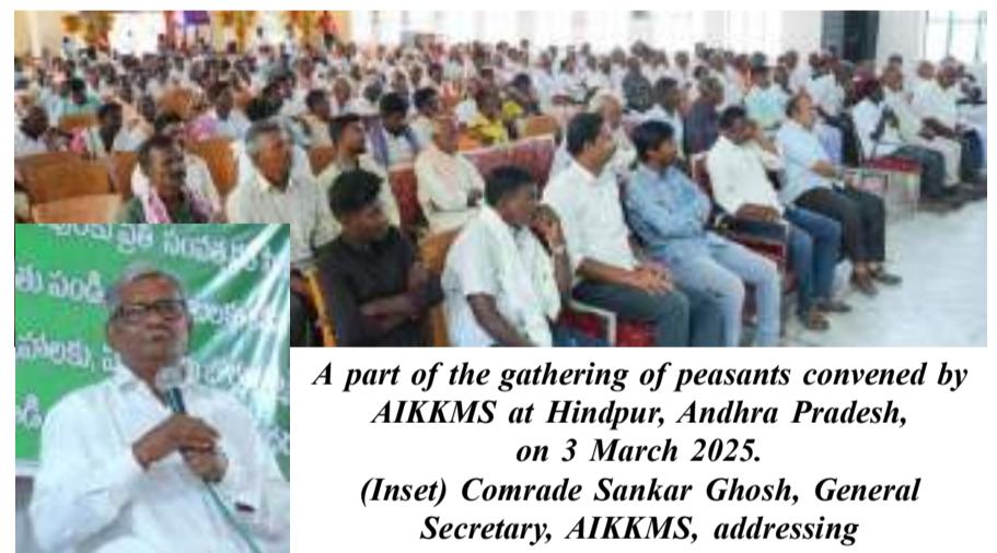
A part of the gathering of peasants convened by AIKKMS at Hindpur, Andhra Pradesh, on 3 March 2025.

Committee also extended revolutionary greetings to the people of Nalbari District who continuously participated in the mass movement. They said it is a victory of people's movement.