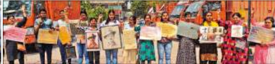
▲ Delhi