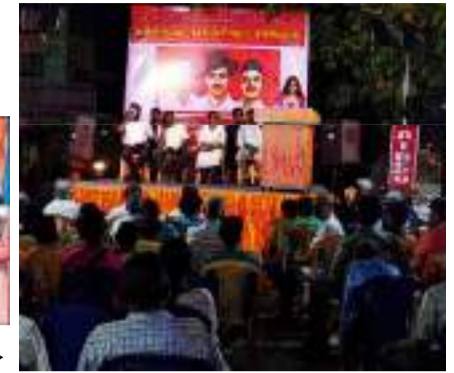
► Puducherry by AIDS0