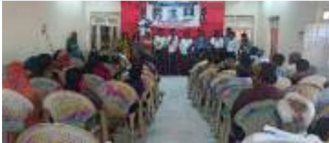
▲ Pilani, Rajasthan, by AIDYO

The day was observed in a befitting manner round the country by AIDS0, AIDYO, AIMSS and Komsomol