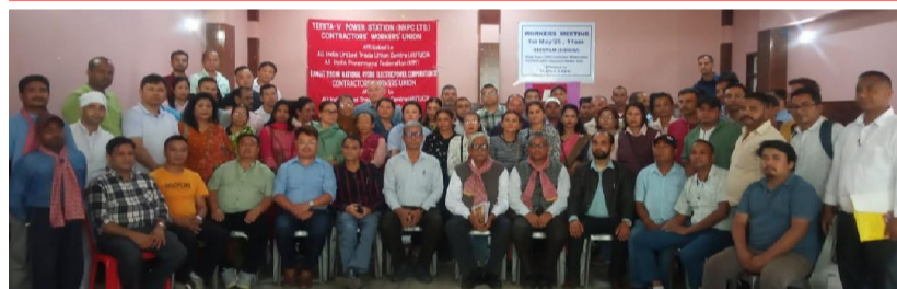
May Day Observance in Sikkim by AIUTUC