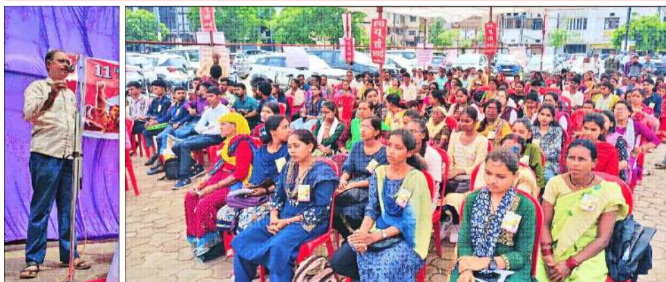
Chhattisgarh State level demonstration on 11 September in Raipur on a 16-point charter of demand.

Just as the vested interests have destroyed the sculptures to tarnish the people's uprising, pro-coup pro-democracy people and artists have actively come forward to repair the sculptures. We have witnessed many such incidents.