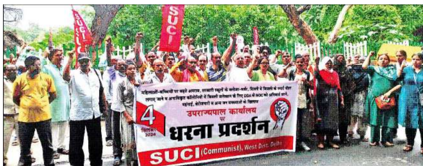
Demonstration in Delhi on 4 September against unemployment, price rise, crime against women and smart metre installation