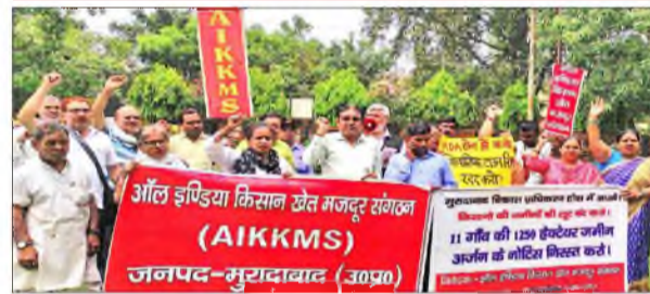
AIKKMS demonstration at Moradabad, UP, on 24 June 2024 against forcible acquisition of arable land