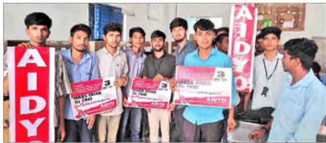
Mass E-mail programme by AIDYO against cell phone tariff hike in Hyderabad, Telangana