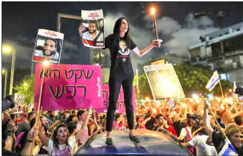
Tel Aviv 29 June 2024

have called for the operation to be halted. Around 2,00,000 people reportedly have been killed during Israel's offensive in Gaza since then, the Hamas-run health ministry says— many of them women and children. More than 10,000 children