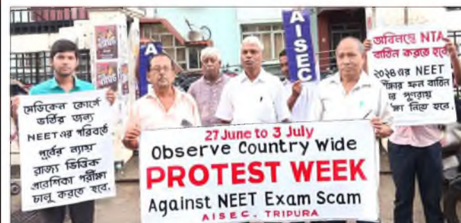
Protest in Agartala, Tripura, on 3 July 2024 against NEET, NET scam