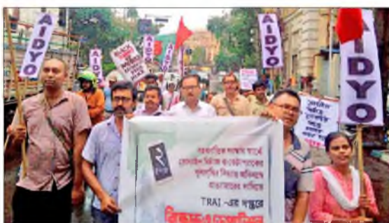
AIDYO's rally in Kolkata demanding withdrawal of increased mobile tariff

We also urge upon you to request the central government to take immediate steps to rejuvenate BSNL and provide communication services at a fair and affordable price to the toiling people.