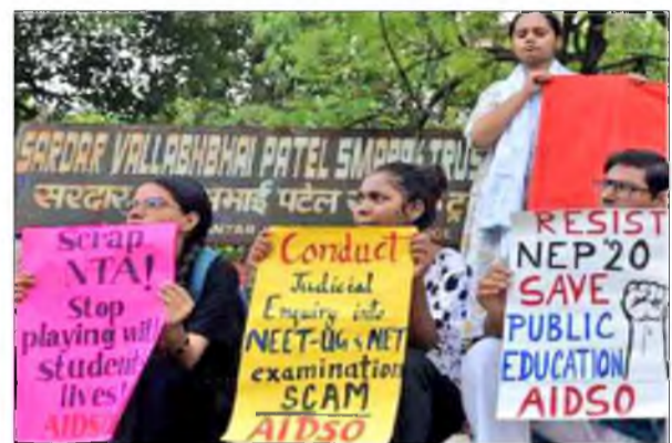
Protesters stage a demonstration in New Delhi against the alleged irregularities in NEET-UG